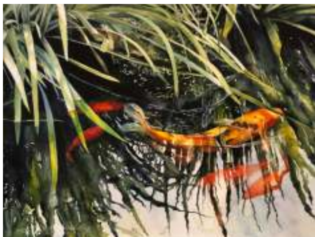
Always More Fish