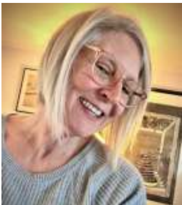
Cover: Big Woo, No. 1

Snow one day, air conditioning-worthy temperatures the next—winter can certainly be unpredictable! The weather may be crazy, but there is something that you can count on: your arts center providing a jam-packed schedule of creative classes, exhibitions, and programs each season, and this spring is no exception. In this issue of Delaplaine Arts, you will find nine on-site exhibitions featuring local, regional, and national artists; six community art exhibitions; three satellite exhibitions at local libraries; 38 classes and workshops for teens and adults in a variety of media; 13 youth classes; and 16 public programs, all coming your way over the next few months. You’ll also find information about our ongoing community outreach, renting our facilities, and much more. Plus, you also get a preview of 36 summer art camps for kids and teens. Camps fill up fast, so don’t delay registering!