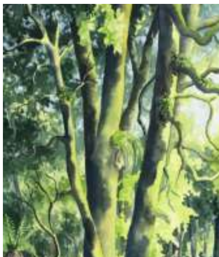
Tree Near Damper Falls

Paintings in this exhibition come from Hoffman's desire to pull inspiration from differing landscapes by utilizing a variety of media.