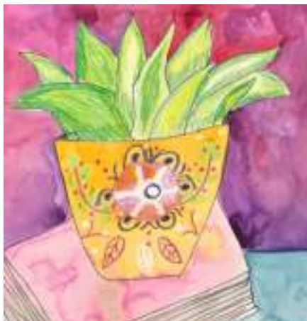
Image Transfers and Mixed Media (Ages 6-10)